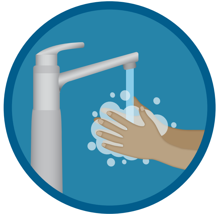
Wash hands here