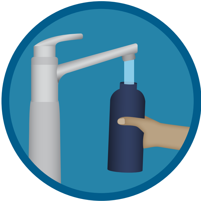
Drink water here