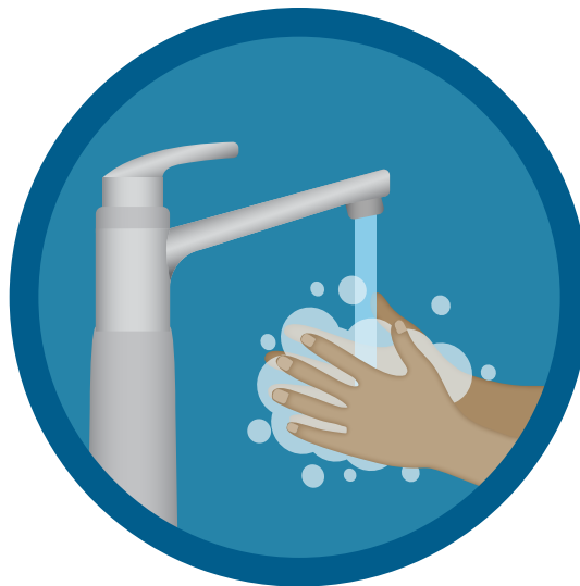
Wash hands here