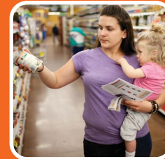
Special Supplemental Nutrition Program for Women, Infants & Children (WIC)