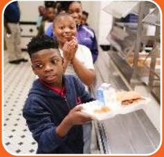
National School Lunch Program (NSLP)