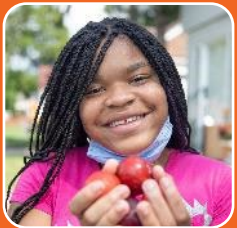
Fresh Fruit & Vegetable Program (FFVP)