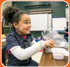
School Breakfast Program (SBP)