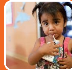
Child & Adult Care Food Program (CACFP)