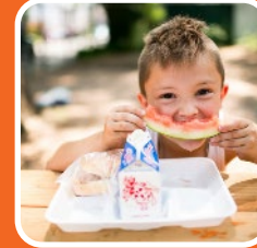
Summer Food Service Program (SFSP)